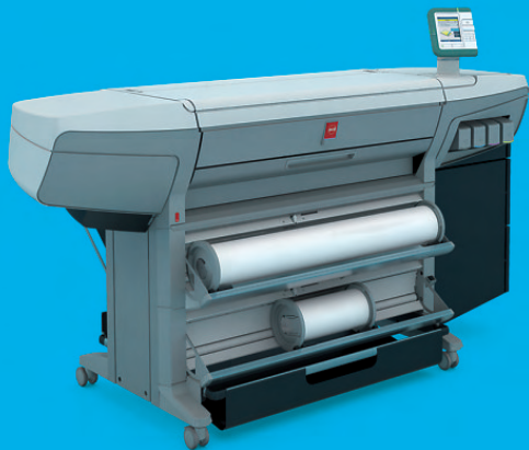
Océ ColorWave 300 R