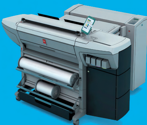
with Océ estefold 2400