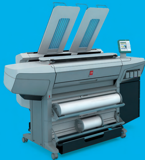
Océ ColorWave 300 T