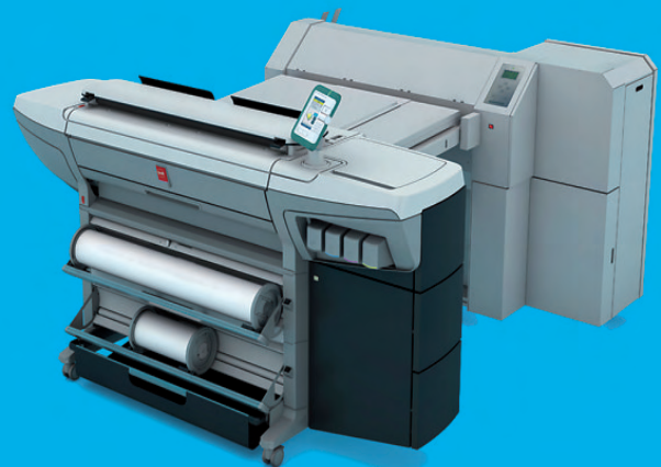
with Océ estefold 4211