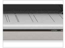
Contex ALE Technology ensures accuracy between any 2 points on the document