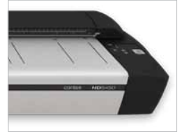
Contex Extended Data Transfer Rate improves scanner speed at high resolution