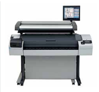
HD Ultra i4220S MFP

Choose this affordable MFP solution as your daily tool for copying office graphics and documents. Perfect for small offices or businesses where traditional large-format copy solutions are too expensive or too large.