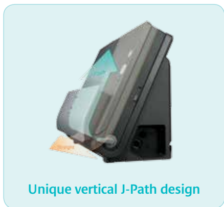
Unique vertical J-Path design

The vertical J-Path design allows documents to be fed and received vertically, so no extra desk space is required. Side-mounted cables and ports let you place both devices directly against a rear wall, or even on a shelf, for the ultimate in space-saving convenience.