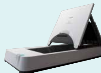
A4 Flatbed Scanner Unit 101

Scan bound books, journals and fragile media by adding the Flatbed Scanner Unit 101 for documents up to A4 or Flatbed Scanner Unit 201 for A3 scanning. Connected by USB, these flatbed scanners work seamlessly with the DR-C225 (only) in a smooth dual-scanning operation that lets you apply the same image-enhancement features to any scan.