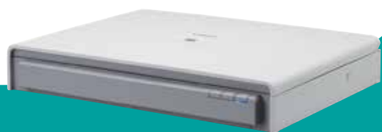
Optional A3 Flatbed Scanner Unit 201