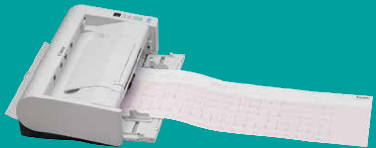
Long Paper Scanning