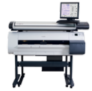
SD 4400 MFP