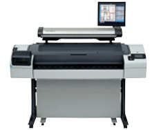
SD 3600 MFP