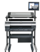
XD 2400 MFP