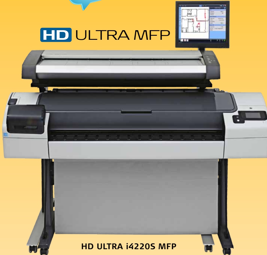
HD ULTRA i4220S MFP