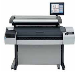
HD Ultra i4220S MFP

Choose this affordable MFP solution as your daily tool for copying office graphics and documents. Perfect for small offices or businesses where traditional large-format copy solutions are too expensive or too large.