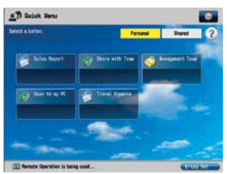
The look and feel of the screen can be personalised for each user, and personal workflows can be set to increase convenience and productivity.

IDC Hardcopy Device Usage - Effect of Mobility On Print,