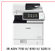
Desktop Use without finisher