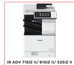
Desktop Use with built-in finisher