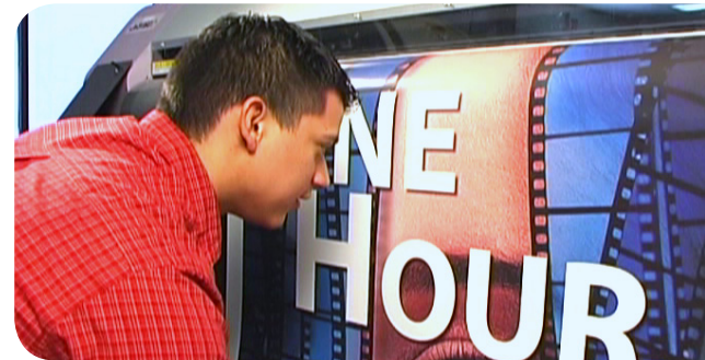
Print to 1 Aqueous Ink Jet or Entry Level Solvent printer.