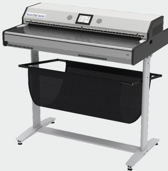
Side view of the WideTEK® 36DS with document collection basket. Scan stacks of newspaper pages without having to collect them each time they go through.

The scanner features two camera boxes, both consisting of three CCD systems, integrated into the upper and lower part of the device. WideTEK® 36DS captures both sides of the newspaper at the same time. After scanning, software separates the scanned document into four single images, capturing the left and right half of the front and back of the newspaper - everything in one single step.