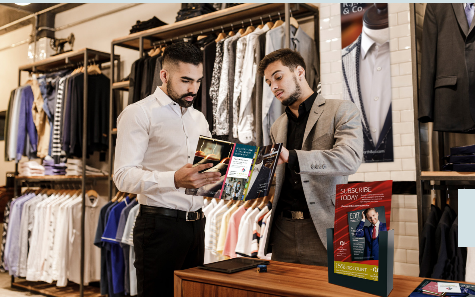
Typical applications of the imagePRESS C170 Series in a retail environment