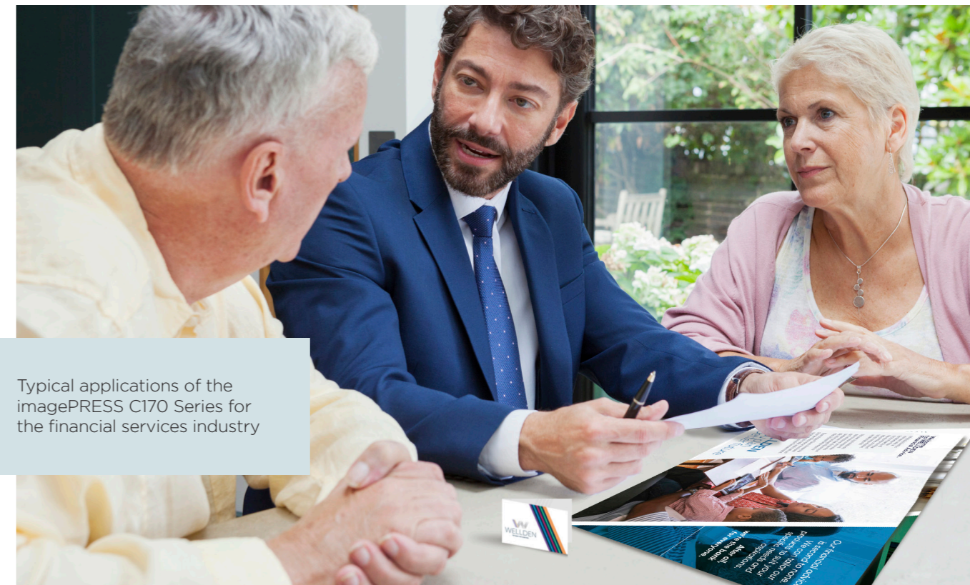
Typical applications of the imagePRESS C170 Series for the financial services industry

With Canon, you have a trusted technology partner now and for the future. We're here to support you to maximise your business potential.