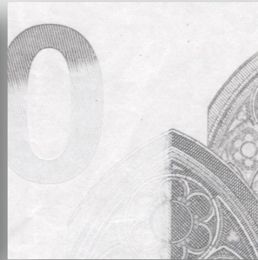
IR-light proves banknote's IR response