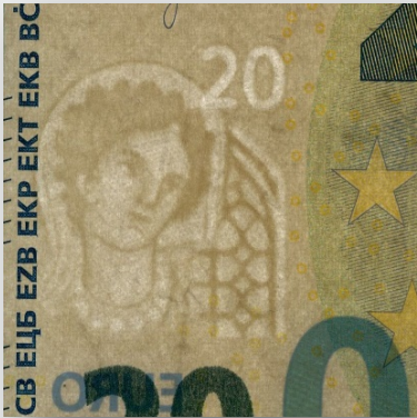
Backlight shows watermarks