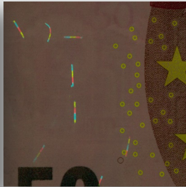
UV-light excites fluorescent ink and fiber